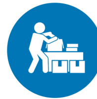
Warehouse and packaging staff